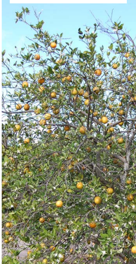
Citrus tree infected with HLB.