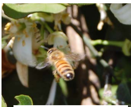
Honeybee and hives in citrus.